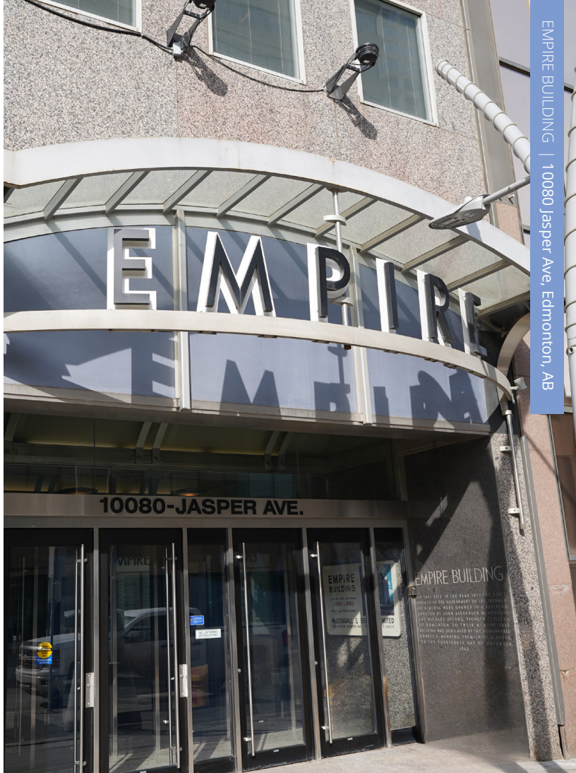
EMPIRE BUILDING | 10080 Jasper Ave, Edmonton, AB