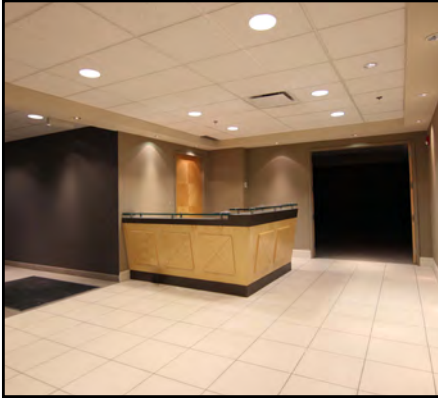
Suite 210 Reception