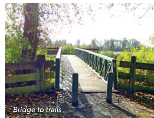
Bridge to trails