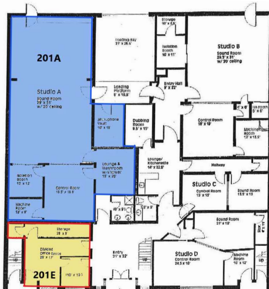
201 West 7th Ground Floor