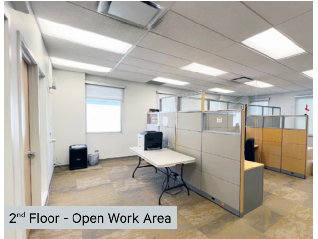
2 nd Floor - Open Work Area