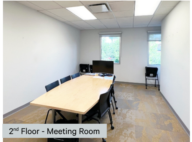
2 nd Floor - Meeting Room

Parking Rates Surface: $150 / month Underground: $200 / month