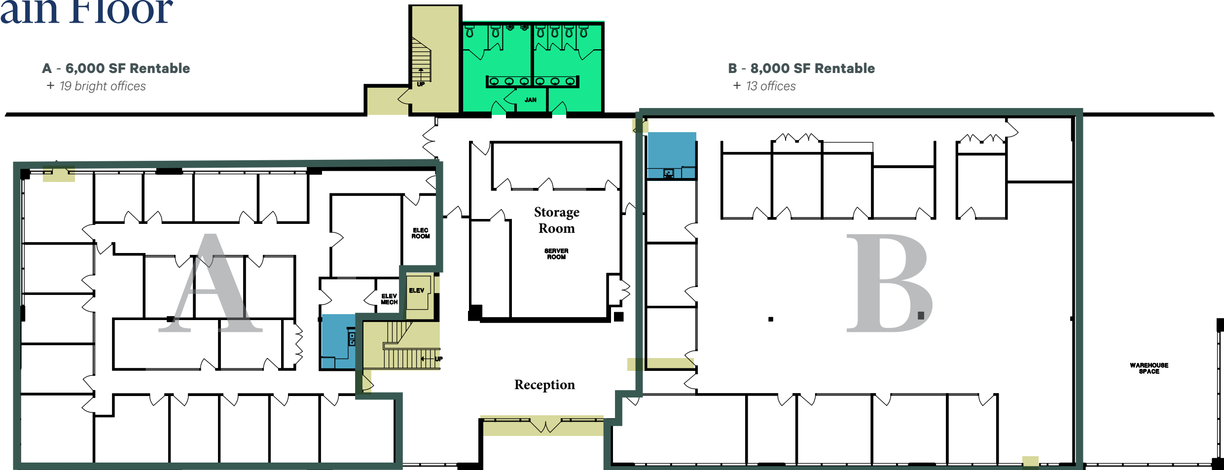
Floor Plan Not to Scale