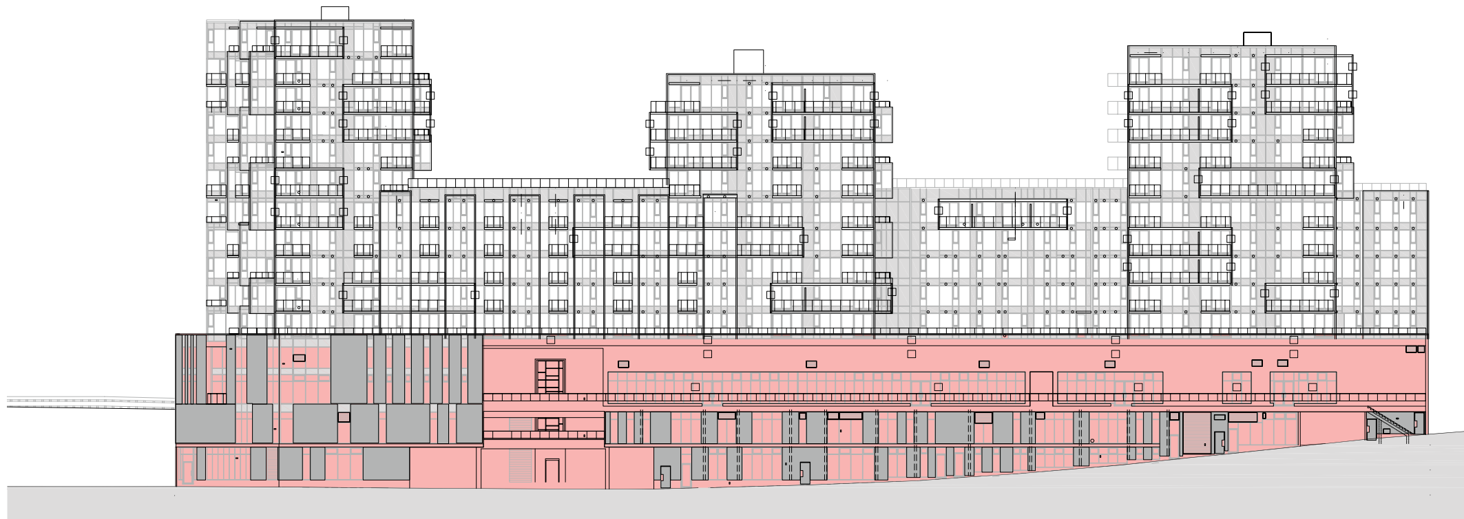
Raymur Level - North Exposure

The first ever industrial, retail, office and residential mixed-use development in North America