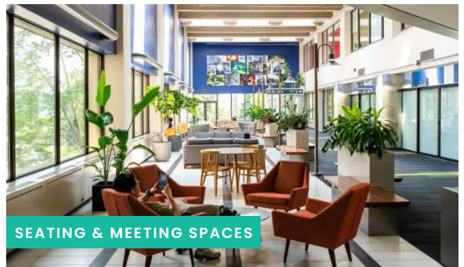
SEATING & MEETING SPACES