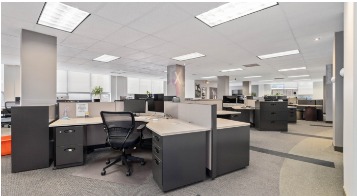
(Approximately, not to scale)