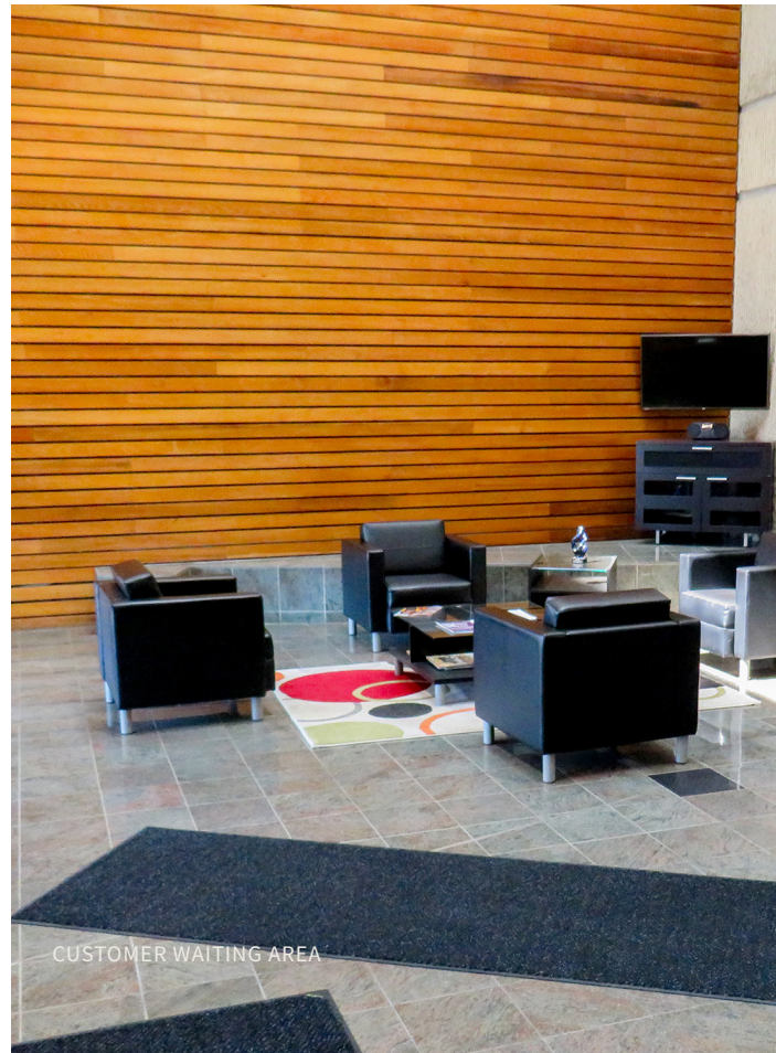
CUSTOMER WAITING AREA